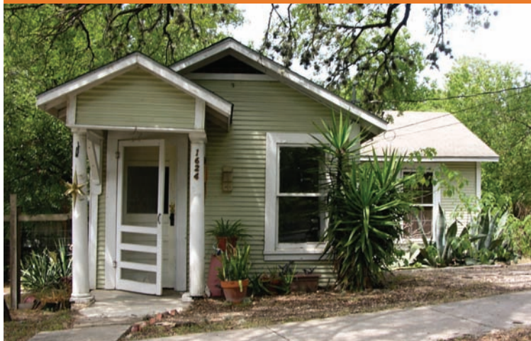
Below: 1624 West 10