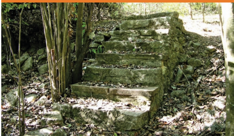
Remains of steps of Texas Confederate Home for Men