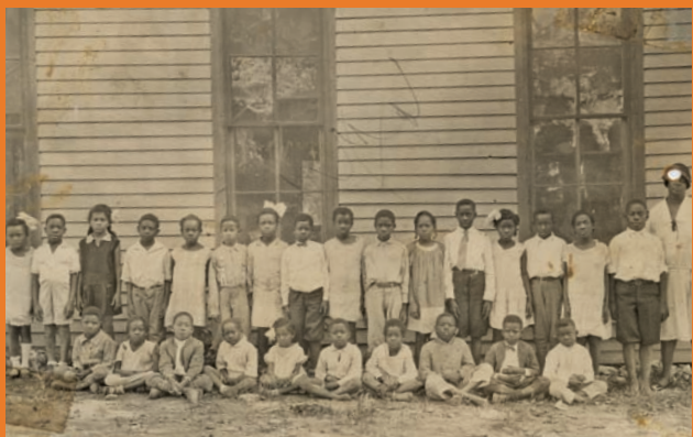
Photo believed to have been taken of school students in front of church