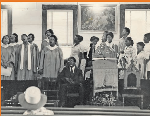
Choir singing inside current Sweet Home Missionary Baptist Church.