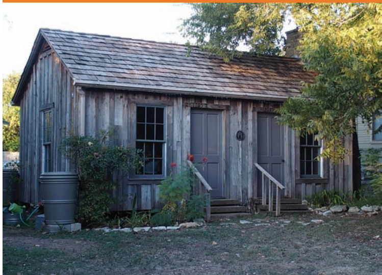
Above: Haskell House today