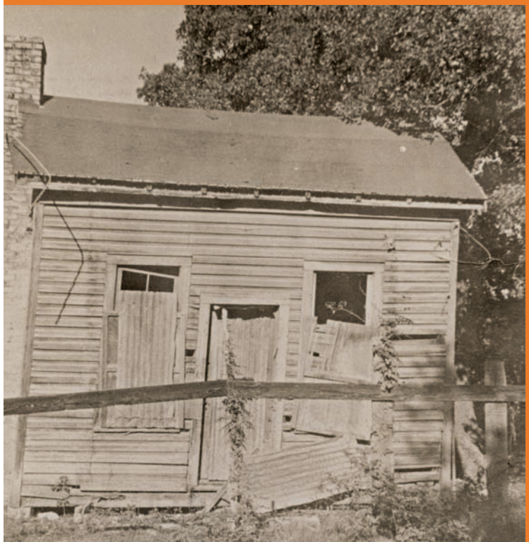
Below: Back of Haskell House, circa 1970