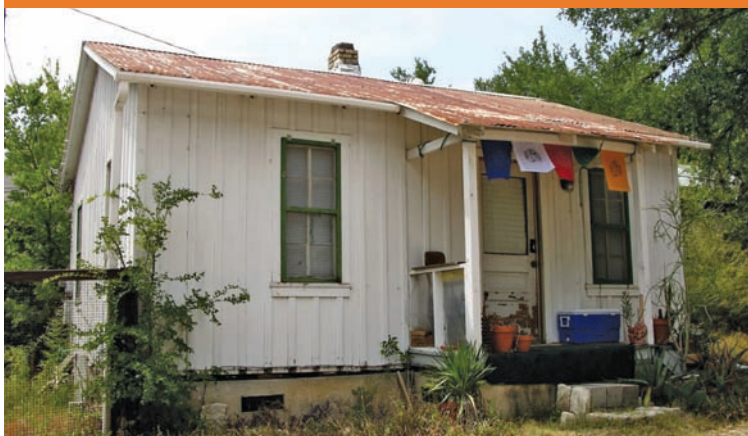
1710 West 10th Street (relocated to face West 11th Street)