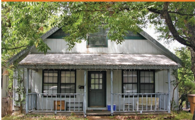
1618 West 10th, not original home