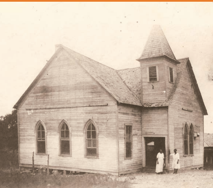
This is the second structure of Sweet Home Missionary Baptist Church