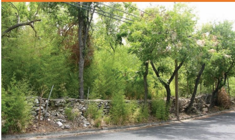
Texas Confederate Home for Men, behind wall