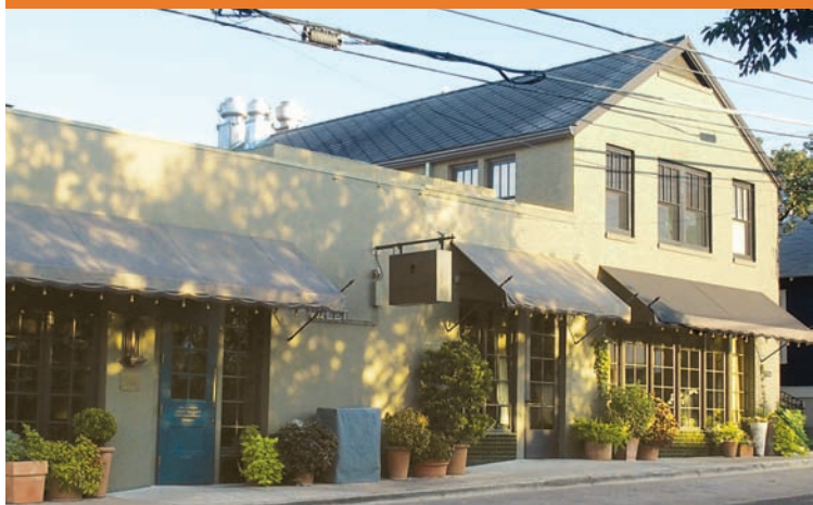
Jeffrey's Restaurant, Josephine House (not shown)