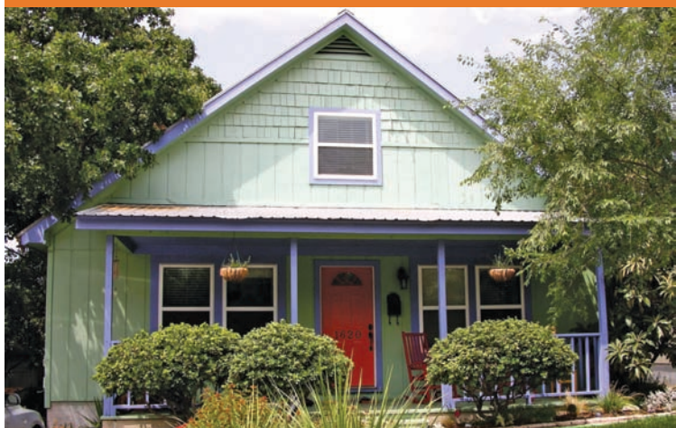
Above: 1620 West 10th, not original home