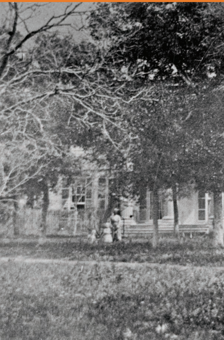
Woodlawn, Home of Governor and Mrs. Elisha Pease