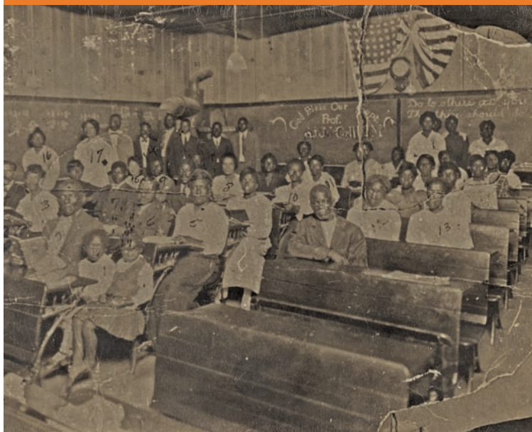
Clarksville Colored School (located in what is now Mary Freeman Baylor Clarksville Park)