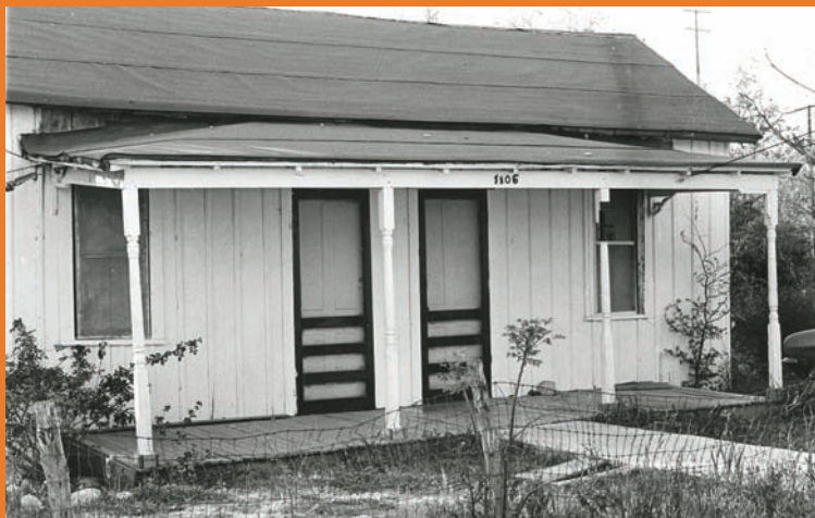
Lawson House then (above) and now (below)