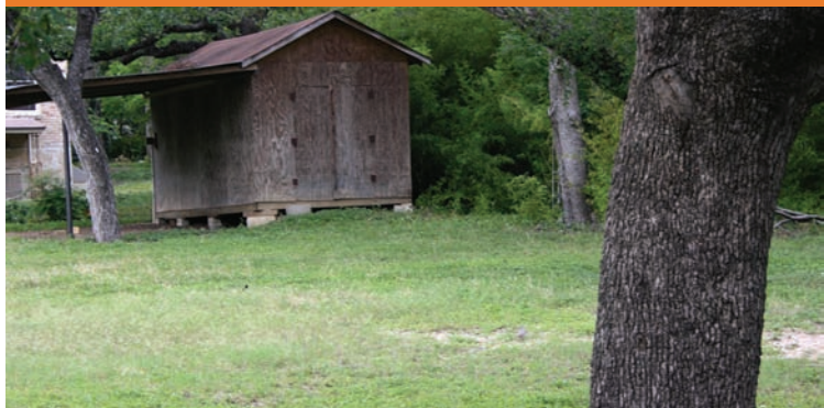
Site of Indian Trading Post, Woodlawn & Waterston