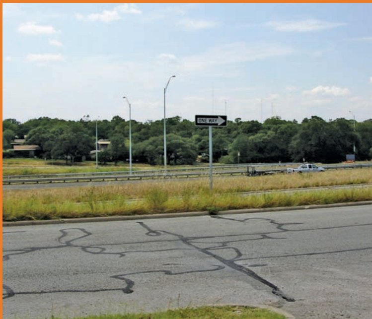
Above: Modern boundary of Clarksville to the west by Mopac Left: Pease Plantation wall remains, 1616 Waterston Avenue