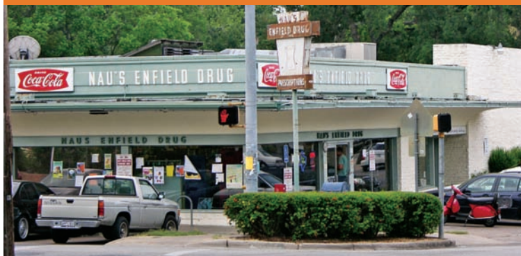
Nau's Enfield Drug, Anthony's Cleaners